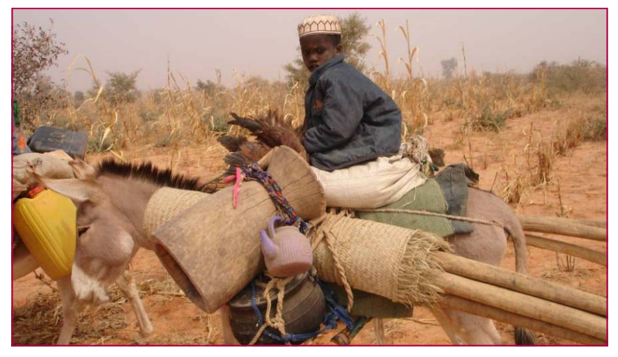
Drought and frequent crop failure in Africa force people to migrate